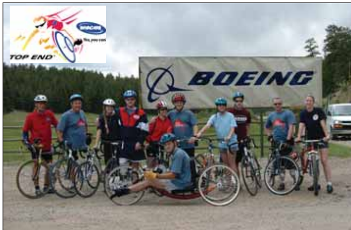
Wounded Warrior disabled soldier group in Evergreen, Colorado

The RMO is sponsored by Boeing, Gary Williams Energy, Argus, Coors Light, Lodo Restaurant Group, Garceworks, Invacare Top End and Tupper's Team with support from Disabled Sports USA, the United States Handcycle Federation, the city of Golden, the Federation of Independent Associations for Cycling (FIAC), the World Handcycle Federation (WHF) and the American Cycling Association (ACA).