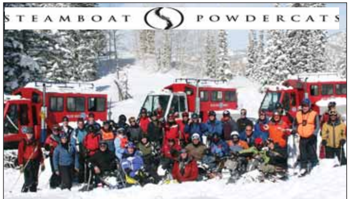
We could not have had a more perfect day for Steamboat Powdercats!