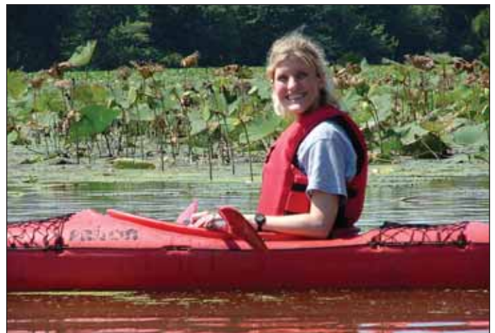
Kayaking on the Mississippi river last summer

More than ever, we are trying to expand our Cycling Team to include additional local volunteers, both able-bodied and disabled. If you are interested in getting involved, please contact us. There will be training days for the program in early May.