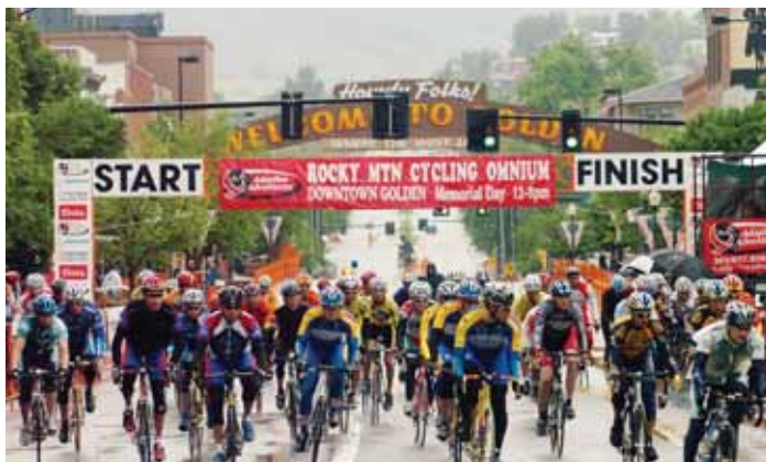
Start for the 2005 RMO in Downtown Golden, Colorado

Adaptive Adventures is proud to host the 7th annual Rocky Mountain Cycling Omnium. This year, our event is the host to the American Cycling Association's Colorado State Criterium Championship and will feature the best cyclists from Colorado and the USA! The event is also the biggest race on the U.S. Handcycling Federation's American Handcycle Series, and has been designated the only Handcycling World Cup race in the United States.