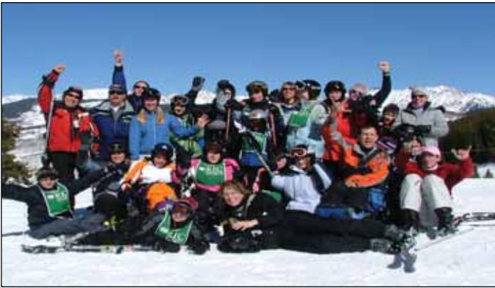
Discover Ability group shot at Mid-Vail.