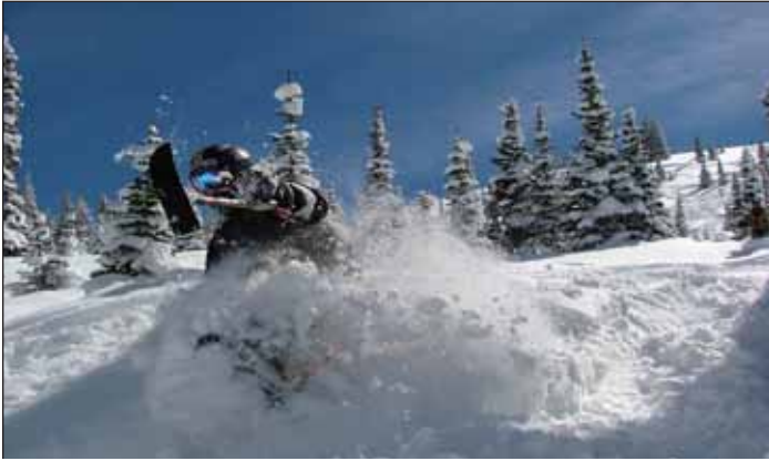
Craig Kennedy of Access Anything blasts through the powder!

The camp included a diverse group with a wide range of abilities and featured seven recently injured soldiers from Iraq as well as six older disabled vets. “I felt like I had the courage to do anything out there...this was the best