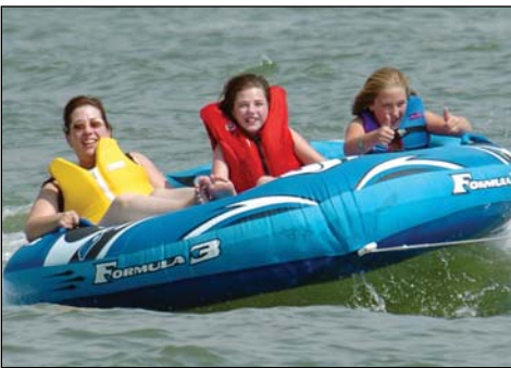
"A picture is worth 1000 words"