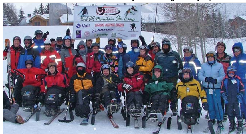
Group shot from 2007 Vail All Mountain Camp.