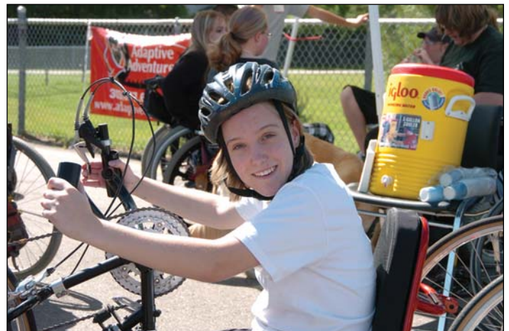
Cycling was a big hit at the Jr. Wheelchair Sports Camps in both Denver, CO and Grand Rapids, MI.