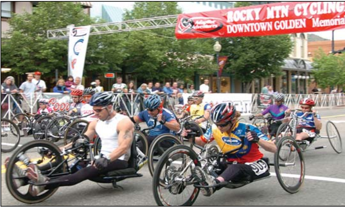
Start for the 2006 RMO in Downtown Golden, Colorado

Adaptive Adventures was proud to host the 7th annual Rocky Mountain Cycling Omnium (RMO). This year's event featured the American Cycling Association's Colorado State Criterium Championship and many of the best cyclists from Colorado and the U.S.! The RMO is a unique event that pairs able-bodied amateur and professional cyclists with disabled cyclists riding on the same courses and racing in front of the same crowds. The event brought athletes of all abilities together for a weekend of learning, empowerment, and fun. The weather at this year's RMO was stellar, a far cry from 2005, and the event included 676 athletes.