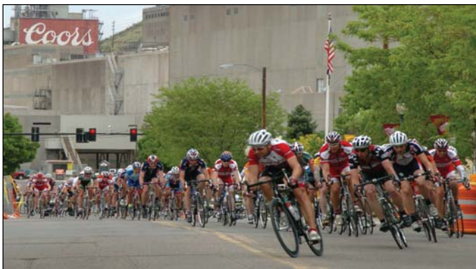
More than 650 athletes competed in the 2006 RMO

The RMO is sponsored by Boeing, Gary Williams Energy, Argus, Coors Light, Lodo Restaurant Group, Garceworks, Invacare Top End, and the Table Mountain Inn. Additional support is provided by the United States Handcycle Federation, the city of Golden, the Federation of Independent Associations for Cycling (FIAC), the World Handcycle Federation (WHF), and the American Cycling Association (ACA).